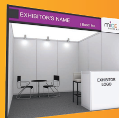
Basic Shell Scheme 9sqm